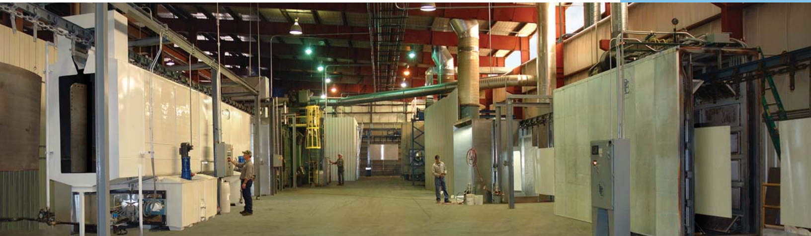
The BOSS Tank powder coating facility has a line rating capacity three times greater than any other bolted tank manufacturer.

At BOSS Tank , we have raised the benchmark of coatings performance in liquid storage applications. At BOSS Tank , we can rightfully claim the premier powder coat line for bolted storage tanks worldwide. Our controlled station processes are unmatched by any other tank manufacturer. LIQ Fusion 7000 FBE™ is the Premier TANK LINING offered in the marketplace today for liquid storage applications. LIQ Fusion 7000 FBE™ is unmatched in all performance standards including low maintenance and cost efficiency. LIQ Fusion 7000 FBE™... the BEST CHOICE to specify for Liquid Storage Tanks!